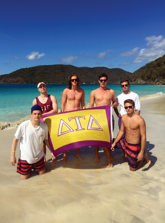
Delts enjoy a well-deserved spring break in St. Thomas, Virgin Islands.

Attention: This newsletter is intended for alumni, undergraduates, and parents. If your son is still attending The Ohio State University, he will receive a copy at the chapter house. If he has graduated, please send his permanent address to to update our records. Thank you.