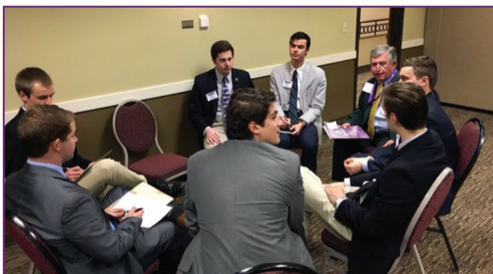
Brothers enjoyed exchanging ideas with the Northern Division.