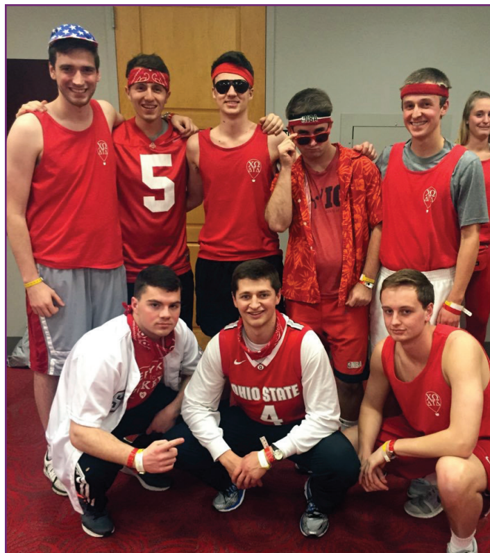
Deltas participate in Buckeyethon, the university's dance marathon that raised over $1.3 million for kids battling cancer at Nationwide Children's Hospital.