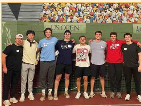
Brothers volunteering for Buddy Up for Life.