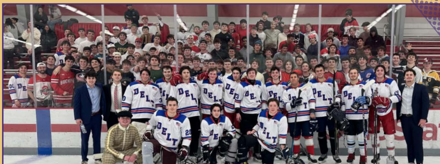
Brothers during our philanthropy hockey game vs. Sigma Chi.

Served the Mid-Ohio Food Collective and Buddy Up for Life