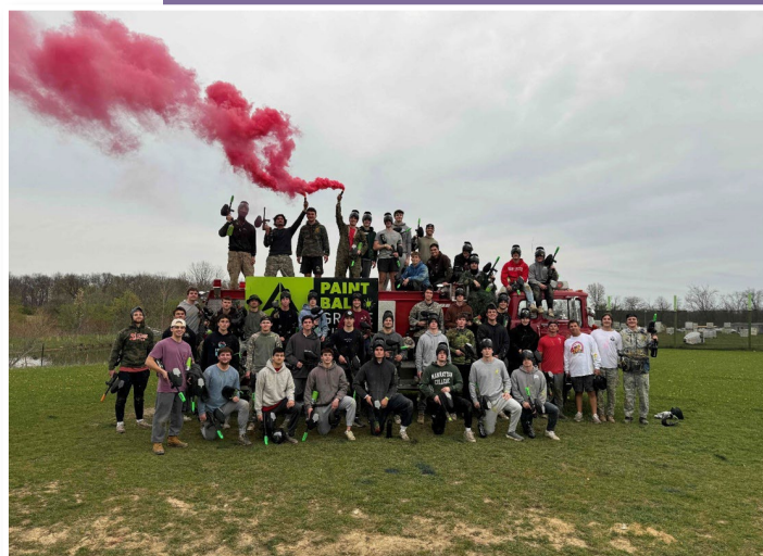
More than 40 brothers gather for an exciting paintball event.