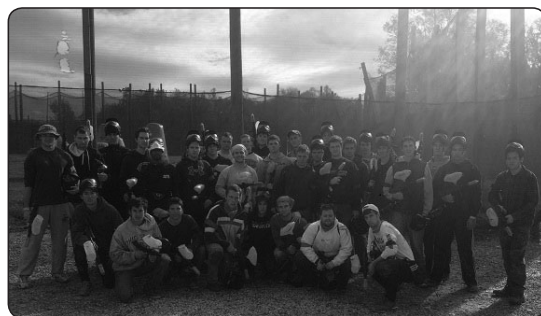
More than 50 Beta Phi brothers played paintball at Splatter Park in Mount Gilead, Ohio on October 20, 2013.