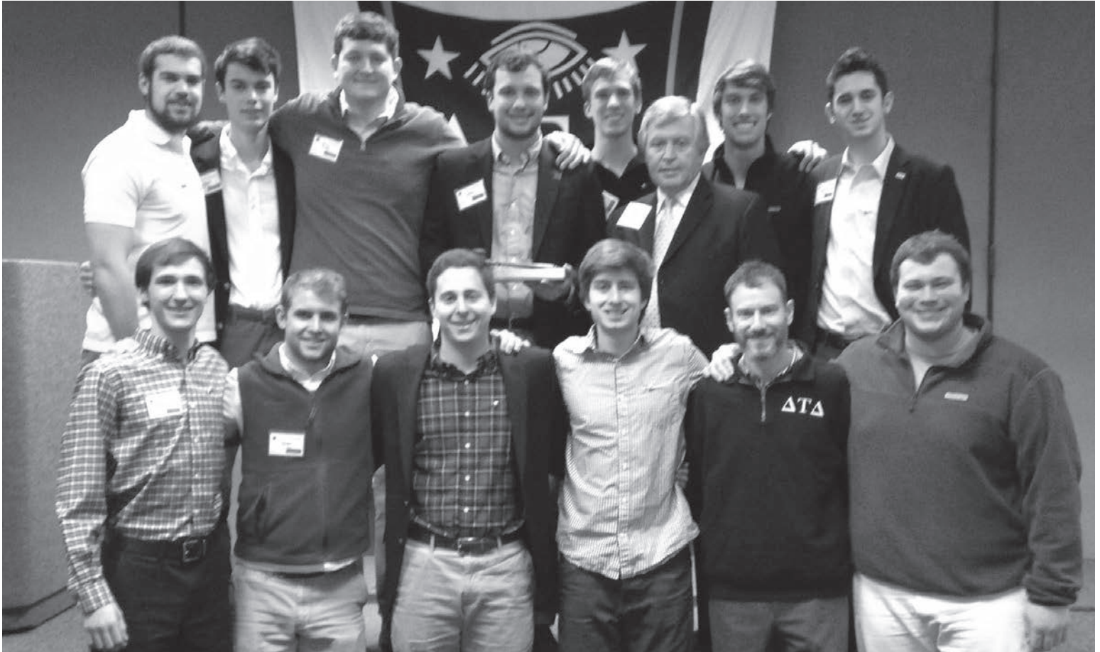
Ten Beta Phi brothers and their alumni traveled to Merrillville, Indiana on January 31, 2014, to attend the Northern Division Leadership Conference. The chapter received the Court of Honor award, an award given to the top 20 chapters each year.